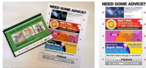
Poster in A4 or A3